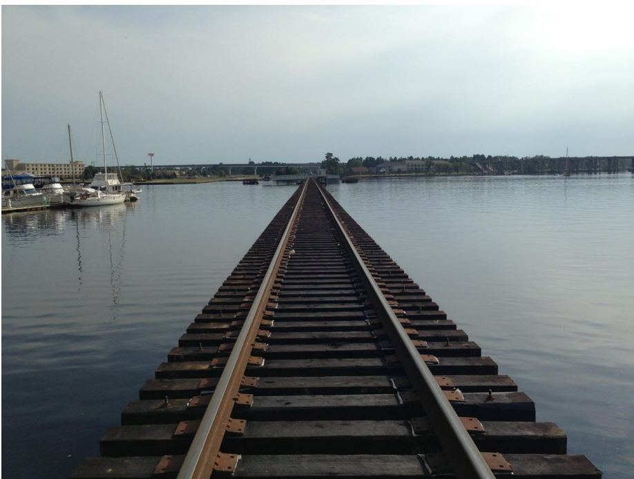
Trent River Bridge, New Bern