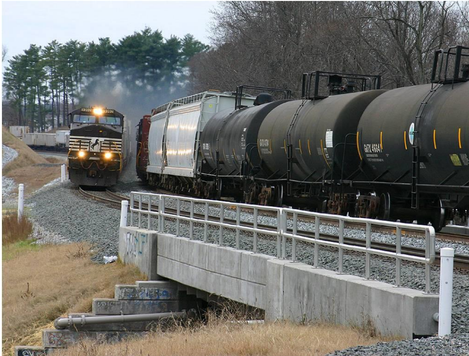
Double Track Near Greensboro