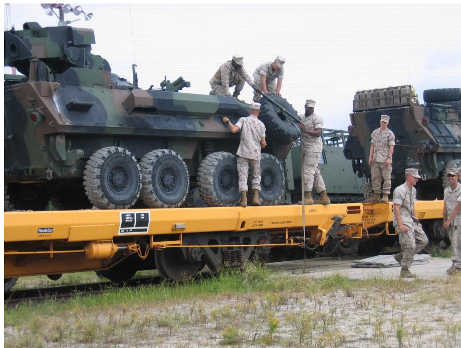
Military Cargo loaded on train at Camp Lejeune